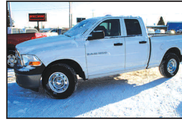
2011 DODGE RAM 1500 CREW CAB Seats 5. Great truck. AS LOW AS $199 A MONTH