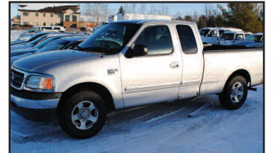
2003 FORD F-150 XLT Extended cab, great price on this truck. AS LOW AS $199 A MONTH