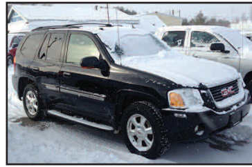
2005 GMC ENVOY. 4WD, leather, loaded. AS LOW AS $199 A MONTH