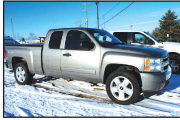
2008 CHEVY SILVERADO LT 4x4, 20 inch wheels, ext cab, soft tonneau cover, tow pkg, bedliner. AS LOW AS $199 A MONTH