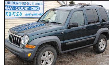
2005 JEEP LIBERTY Hard to find DIESEL. 4WD, tow pkg, 115 K. SALE PRICE $9,995.