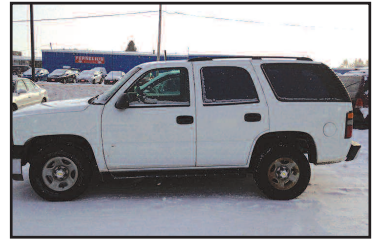
2004 CHEVY TAHOE 4x4, 3rd row seat. Great for a family winter driving. AS LOW AS $199 A MONTH