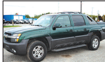
2003 CHEVY AVALANCHE Z-71 4x4, leather, tow pkg, bedliner, cover. AS LOW AS $199 A MONTH