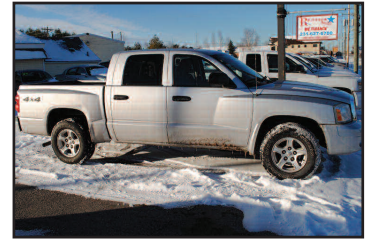
2 TO CHOOSE FROM. 2006 DODGE DAKOTAS Crew Cab, seats 5, 4x4. Nice trucks. AS LOW AS $199 A MONTH

989 VFW RD., CHEBOYGAN, MI • 231-627-6700 • WWW.RIVERAUTO.NET