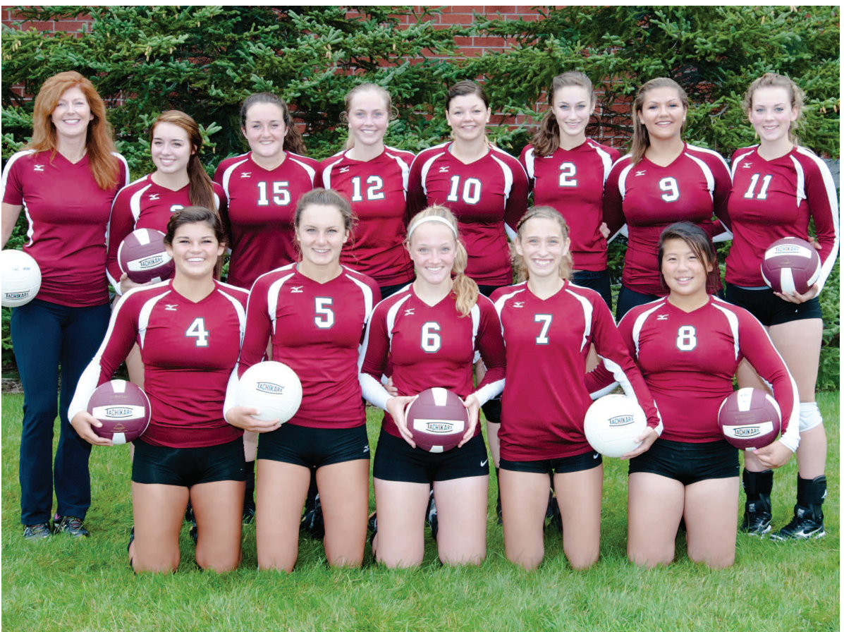
The Rayder volleyball team won their first district championship since 2011, advancing to the regional finals behind strong team play.