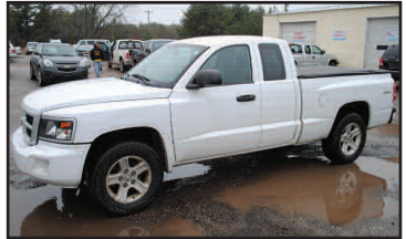
2 TO CHOOSE FROM. 2010 DODGE DAKOTA Big Horn Edition. 4x4, tonneau cover. AS LOW AS $199 A MONTH