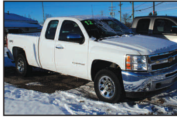
2012 CHEVY SILVERADO 4x4. Tow pkg, ext. cab. Good, clean truck. AS LOW AS $199 A MONTH