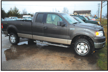
2006 FORD F-150 4x4, bedliner, tow pkg, 5.4 Triton, Club cab, seats 6. AS LOW AS $199 A MONTH