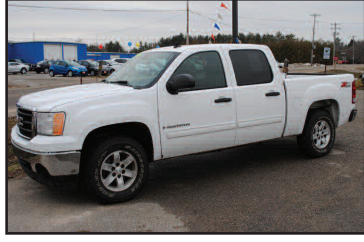
2009 GMC SIERRA SLE Z-71 4x4, tow pkg, bedliner, crew cab. AS LOW AS $199 A MONTH