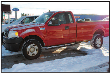
2006 FORD F-150 4x4, bedliner, tow pkg. AS LOW AS $199 A MONTH