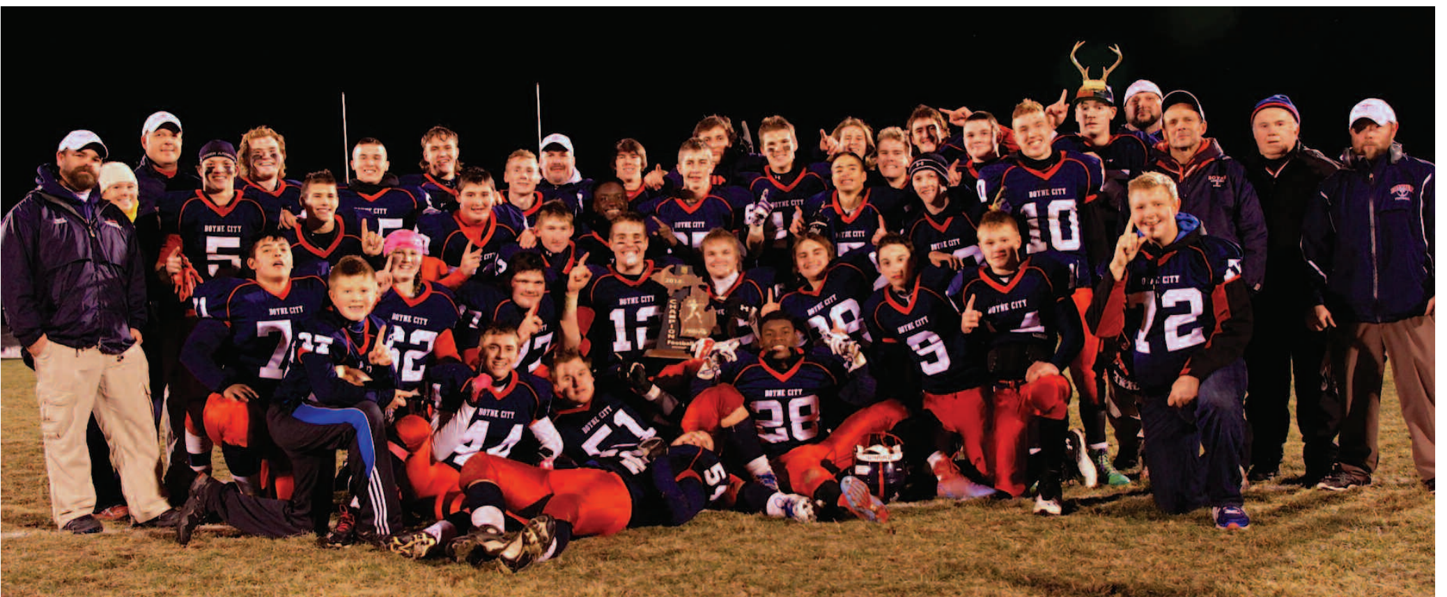
Boyne City football team claimed their first regional title since 2001