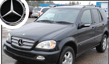
2004 MERCEDES ML 350 AWD, leather, heated seats, power moonroof. Only 91 K. SALE PRICE $9,999.