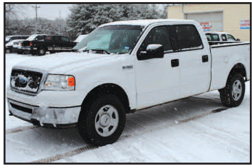
2008 FORD F-150 XLT 4WD, ext cab, bedliner, 4 door. SALE PRICE $8,500