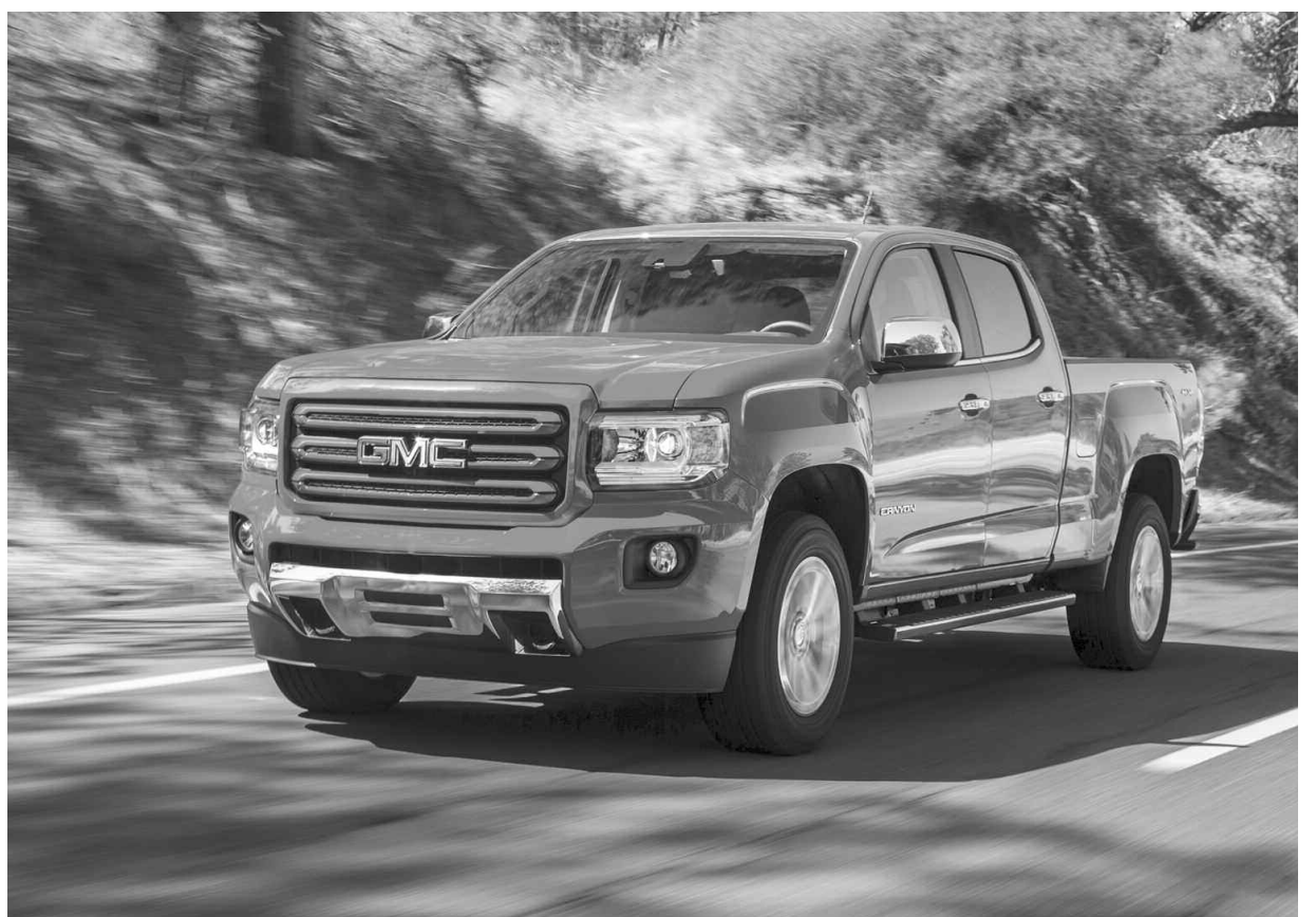
GMC Canyon today was named Autoweek's Best of the Best/Truck for 2015. Editors praised the all-new premium midsize truck for its design, utility, features and "perfect size."